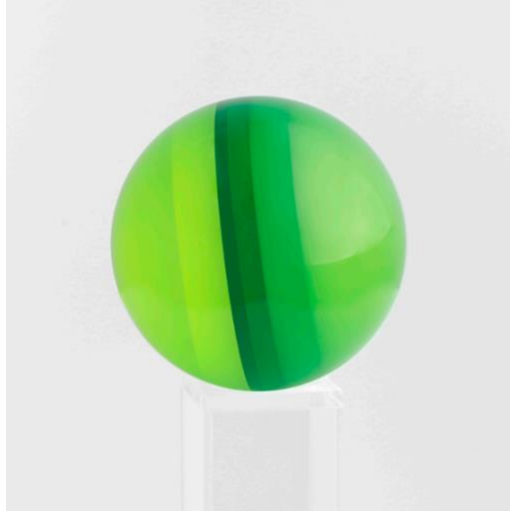
Helen Pashgian, Untitled , 2018, epoxy and acrylic 7 inches diameter, Image © Radius Books. Courtesy of the Tia Collection.