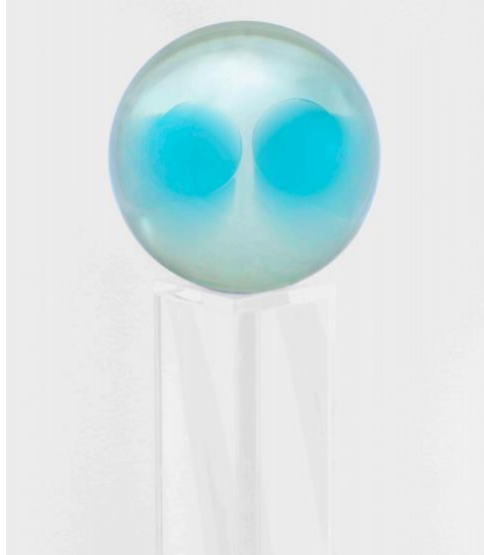
Helen Pashgian, Untitled , 2010-11, Polyester resin and acrylic 7 inches diameter, Image © Radius Books. Collection of Jayne Flinn