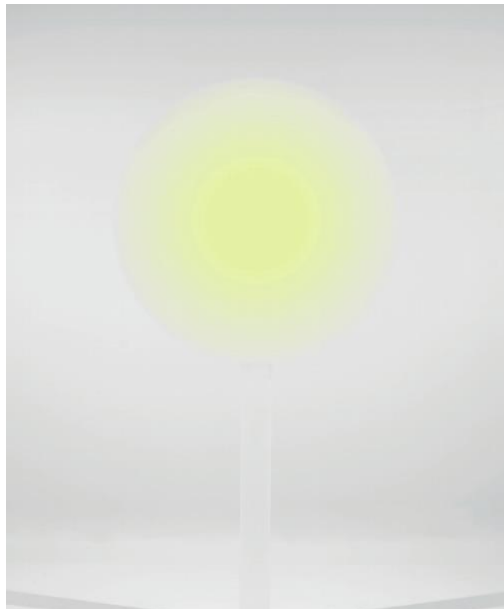
Helen Pashgian, Untitled (lens) , 2019 epoxy and acrylic 48 inches diameter, Image © Radius Books. Representational image