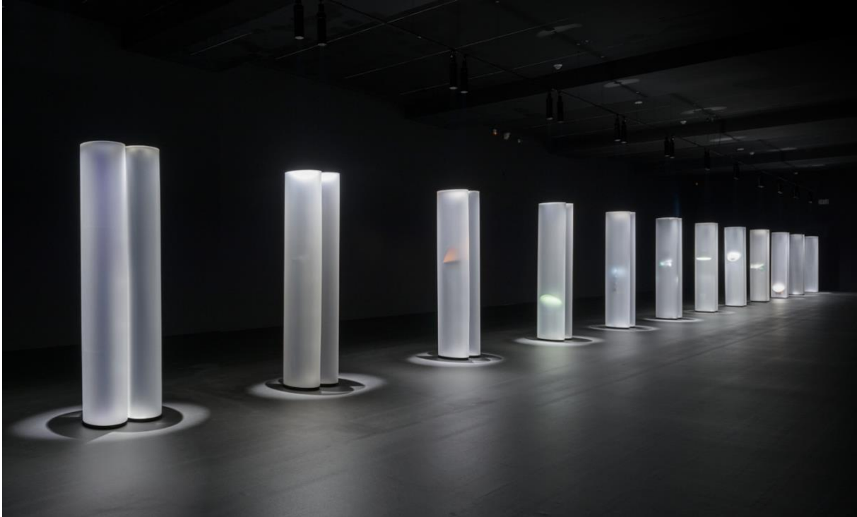
Helen Pashgian, Untitled , 2012–2013, formed acrylic, dimensions variable, Los Angeles County Museum of Art, purchased with funds provided by Carole Bayer Sager on the occasion of the 2014 Collectors Committee, installed in Helen Pashgian: Light Invisible at the Los Angeles County Museum of Art, March 30–June 29, 2014, art © Helen Pashgian